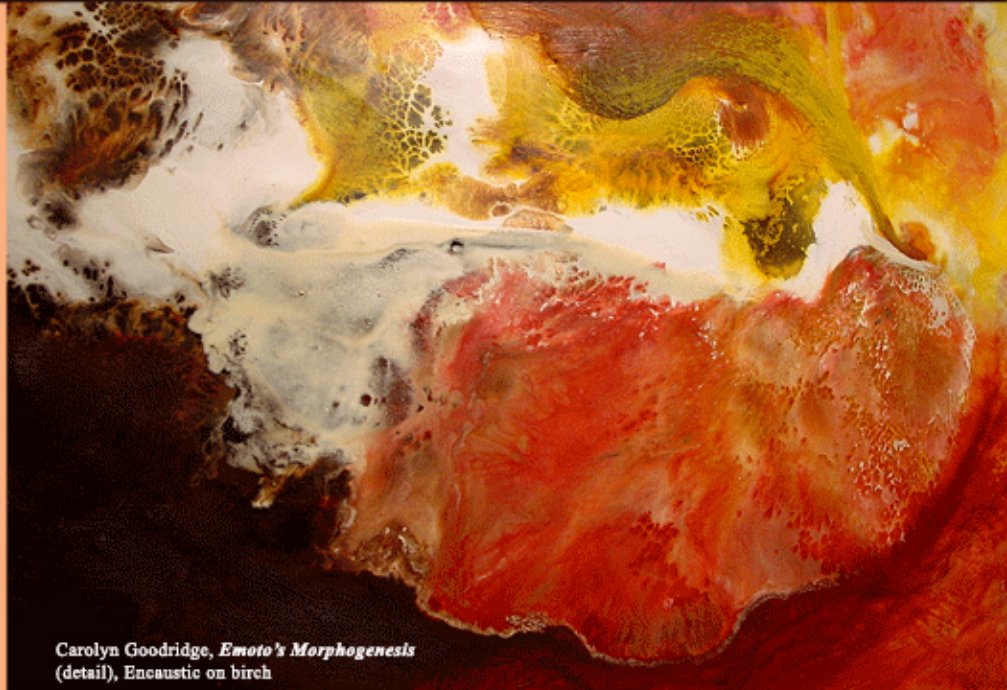
Carolyn Goodridge, Emoto's Morphogenesis (detail), Encaustic on birch

Encaustic comes from a Greek word which means "burn in". This ancient medium and technique of melted beeswax mixed with pigment was notably used in the Fayum mummy portraits from Egypt around 100-300 AD, but can date back as far as 800 BC. Now, in the 21st century encaustic painting remains still a true skill.